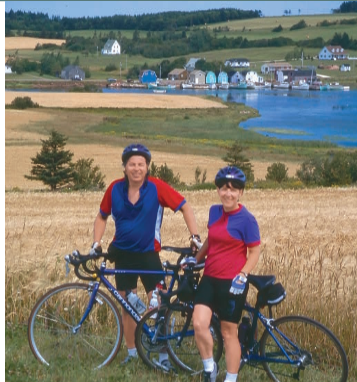
Overlooking French River

Tour Price $2,089.00, 6 nights (Includes breakfasts, 5 dinners, 1 picnic lunch & airport transfers)