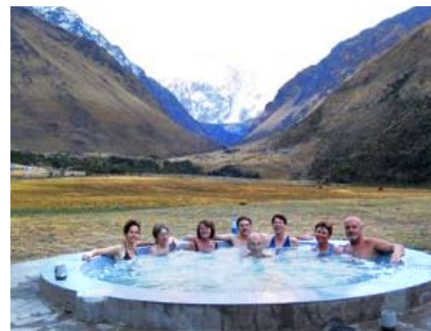
Photo: Evening happy hour in the jacuzzi at Salkantay Lodge.

A: Tips are not included in the trek rate. The recommended amount is as follows: US$20 per guest at the Salkantay Lodge, US$5 per guest at Wayra, Colpa and Lucma Lodges, US$5 per guest for mule-drivers, and US$10 per guest for route chef and assistant cook. For the lead guide the industry standard is US$5-10 per day per guest; and US$3-5 per day per guest for the assistant guide. All tipping is optional, but much appreciated by the entire staff.