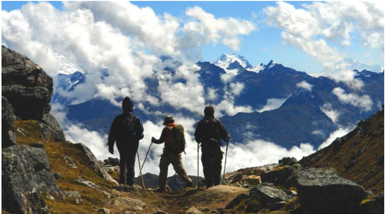
Photo: Descending from Salkantay Pass.