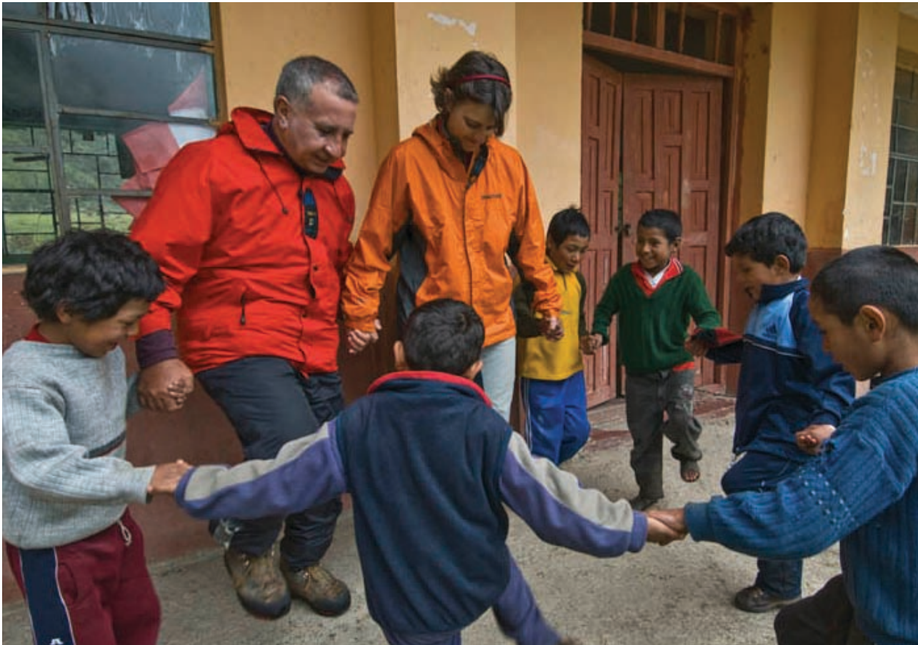
Photo: Guests with children at Machayhuayco primary school, one of the many projects sponsored by Yanapana and MLP.

"We cannot set up lodges living 'affluence' without looking outside where there is so much poverty."