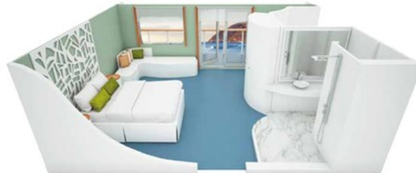
LEGEND BALCONY SUITE

Each cabin includes a private bathroom (with hair dryer & toiletries), phone (local calls only), safe deposit box, air conditioning and a TV. Voltage is set for 110 volts/60 Hz. There is Wi-Fi access in the lounge area.