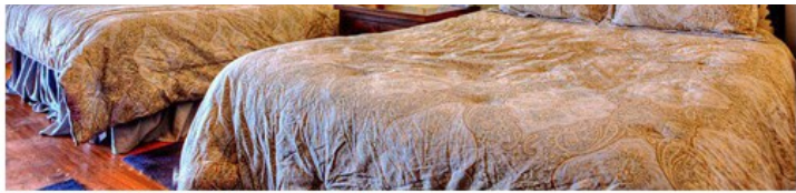
Standard Double Room (approx. 355 sq feet) Each room has two queen size beds and a private bath.