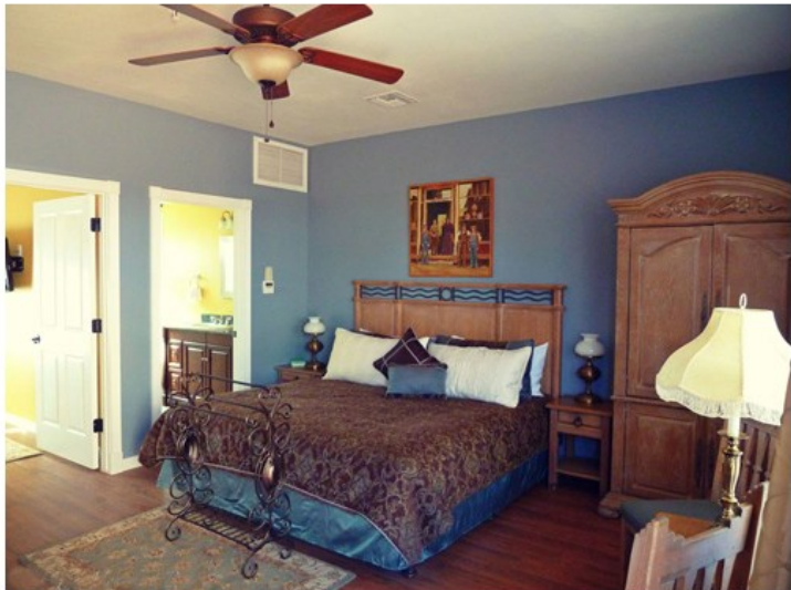
Junior Suite (approx. 400 sq feet) Wake up to a gorgeous sunrise, streaming in across the town in one of our western themed Junior Suite Rooms. Complete with a queen bed and a separate room with a king bed, private bath plus amenities.