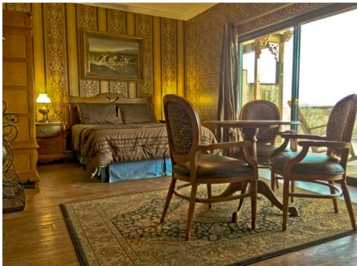
Premium Suite (approx. 495 sq feet) Designed with turn of the century décor our premium suites create the feel of stepping back in time without losing any of today's luxury. Complete with a queen bed and separate bedroom with a king bed, private bath with tub/shower combo and bath amenities. Our Premium suites also have a small kitchenette with fridge and living