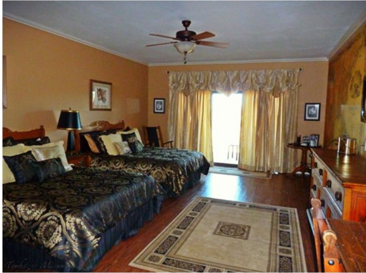
Deluxe Double Room (approx. 400 sq feet) Take in the breathtaking view of the Dragoon Mountains or watch the riders having fun in the arena from the private terrace outside our Deluxe Rooms. Each room has its own unique old west décor with one king size or two queen size beds, private bathrooms with amenities.