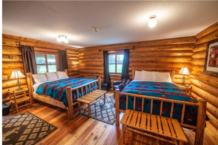
Two Queen Cabins - max 4 people (2 adults & 2 teens) These guest cabins have two queen-size beds, along with all other full amenities. They are great for small families.