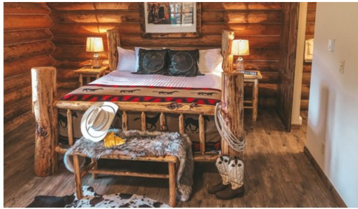
King Suite Cabins - max 2 people The King Suite cabins are fully equipped with an oversized king bed, along with all other full amenities. They are ideal for couples.