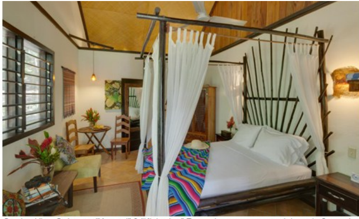
Garden View Cabanas ("Aracari" & "Kiskadee" Rooms) - can accommodate up to 2 people The 2 adjoining Garden View Cabañas share a single building and palm-thatched veranda overlooking the tropical flower garden. They are within easy walking distance of the dining room and bar. These rooms each have 1 Queen sized handcrafted four-poster bed made from indigenous My Lady trees, tiled floors, private hot water bath with a large river stone-lined shower and an industrial ceiling fan.