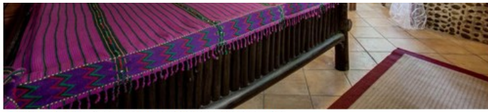
Rainforest Cabin - can accommodate up to 5 people

Formerly the abode of the owners, this 2-bedroom/one-bath cabin features a covered veranda, multiple ceiling fans, and mixture of hardwood and ceramic tile flooring. The master bedroom contains a king-sized bed and panoramic views of the surrounding jungle. The smaller second bedroom is perfect for the kids, with one set of bunk beds. The bedrooms are linked by a half-bath, and there is a second sink basin and separate stone-lined shower room to help as everyone is trying to get ready at the same time.