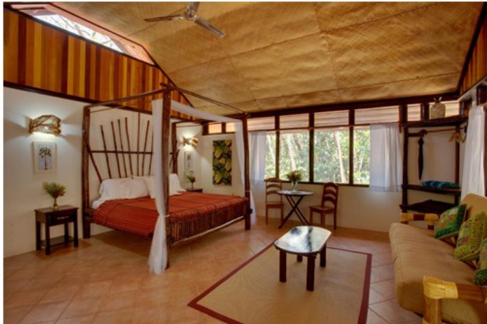
Jungle View Cabanas ("MotMot", "Oropendola", & "Great Currasow" Rooms) - can accommodate up to 5 people (ideally, 2 adults and up to 3 children) Larger and more private than the Garden View Cabañas, the Jungle View Cabañas are spacious, stand-alone rooms offering either a queen-sized or king-sized handmade four poster bed, full sized futon, private thatched roof veranda, and gorgeous views of the surrounding jungle. These rooms all have tiled floors, private hot water river stone-lined showers, 2 industrial ceiling fans and a hammock.