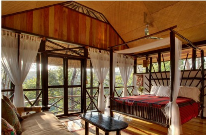
River Valley View Cabana ("Laughing Falcon," "Little Blue Heron," "Purple Gallinule", & "Kingfisher" Rooms) - can accommodate up to 3 people Our most secluded and spacious rooms, these cabañas are prized for their stunning views of the Macal River Valley. Each room is equipped with industrial ceiling fans and private hot water baths with large river stone-lined showers. They feature a large, palm-thatched veranda, a king-sized four poster bed, 1 full-sized futon, and hardwood floors.