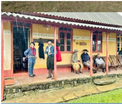
Overnight at Fazenda da Chapada