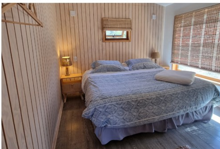
Cabanas Laguna Azul You spend the night in a lovely cabin with private bedrooms.

Enjoy a tea, card game or a good book in one of the three cozy living rooms, where you can also find interesting information about Patagonia, its history and nature. Each of the 12 rooms feature an English style décor. They have central heating, private bathroom, hairdryer, a safe, Wi-Fi connection and views of our gardens.