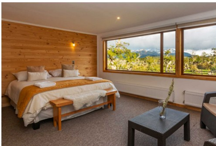
Pampa Lodge This rural hotel puts great attention to details concerning the environment. The rooms are simply decorated and feature as much natural material as possible. Each room is equipped with a private bathroom, heating and free Wi-Fi access.

Estancia Las Chinas You spend the night in a cosy guest house recently converted from an old ranch house. The rooms have 2-4 bunk beds and shared bathrooms with hot water. There is also a small fireplace.