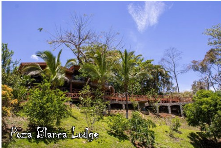
Poza Blanca Lodge

If Cerro Lodge is fully booked, we can offer the same rate using Poza Blanca Lodge. Poza Blanca Lodge is in a secluded location by Machuca river which is ideal for swimming in summer Months (Dec-Apr).