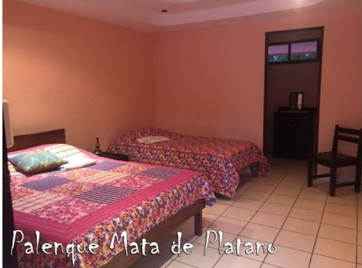
Palenque Mata de Platano

Finca Galán is an ecological farm, which has started offering lodging to selected travelers who enjoy authentic life-changing experiences. Accommodation is in a 3-bedroom/ 2-bathroom bungalow house perched on a mountain slope at the basin of Cerro Galán on the Turrubares Mountains. There is one bedroom with two bunk beds, one with twin single beds, and one with a double bed. Water is brought to the house by gravity directly from a private natural spring source. Cooking is done by gas stove and evening are candlelit. The area is so peaceful and quiet that the only sounds in the morning will be the dozens of singing birds that eagerly await for the first rays of lights at dusk and go to be at night with candles and at the sounds of the tropical forest.