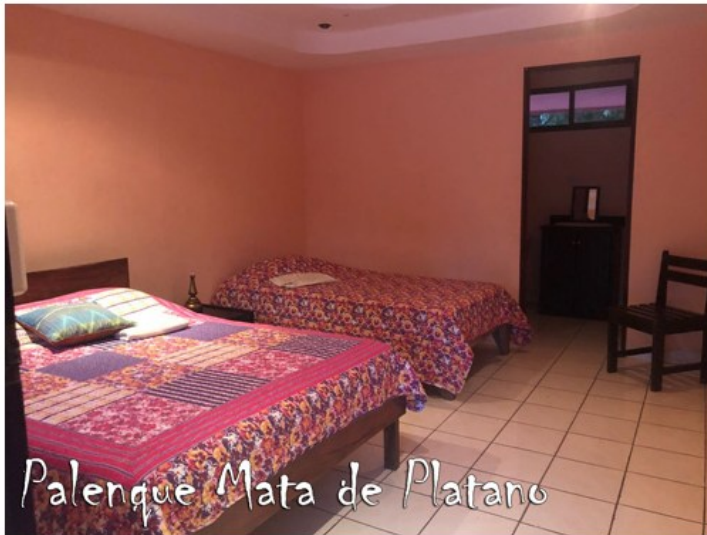
Palenque Mata de Platano

Finca Galán is an ecological farm, which has started offering lodging to selected travelers who enjoy authentic life-changing experiences. Accommodation is in a 3-bedroom/ 2-bathroom bungalow house perched on a mountain slope at the basin of Cerro Galán on the Turrubares Mountains. There is one bedroom with two bunk beds, one with twin single beds, and one with a double bed. Water is brought to the house by gravity directly from a private natural spring source. Cooking is done by gas stove and evening are candlelit. The area is so peaceful and quiet that the only sounds in the morning will be the dozens of singing birds that eagerly await for the first rays of lights at dusk and go to be at night with candles and at the sounds of the tropical forest.