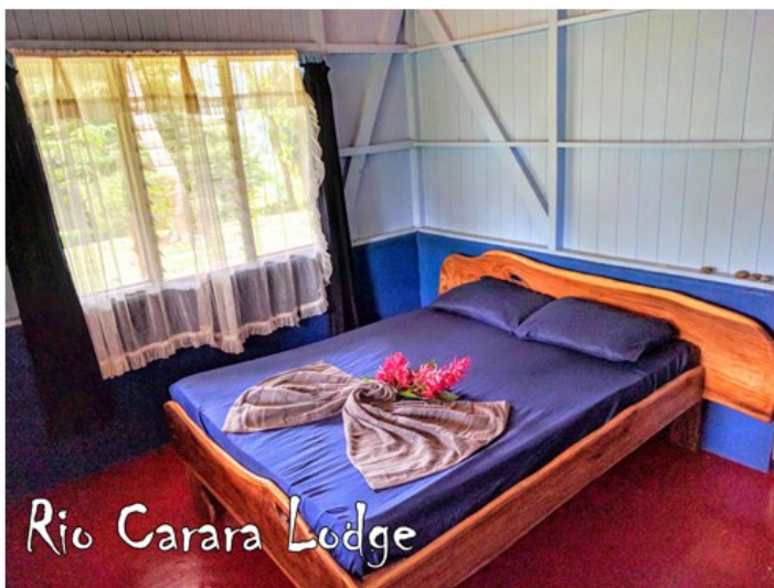
Rio Carara Lodge

This hotel offers comfortable bedrooms equipped with a TV, small fridge, ensuite bathroom and free Wi-Wi access. There is also an outdoor pool where guests can relax.