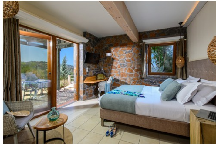
Deluxe Suite (2 adults max) - upgrade

These rooms are located on the ground floor and have access to a patio and garden. They come equipped with either a king-size bed or twin beds and a private bathroom.