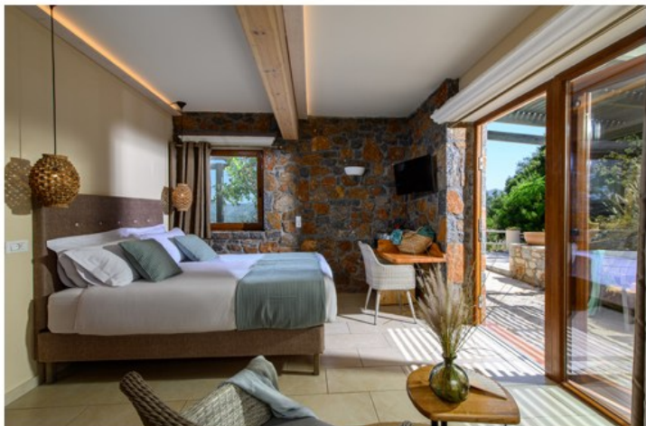
Superior Family Suite (4 adults + 1 child max) - included for 4 pax This 2-bedroom suite is located on the ground floor with its own terrace. This room is composed of 2 adjoining bedrooms and has 2 bathrooms. It is equipped with 1 large double bed (possible to split into 2 single beds) and 2 twin beds. The master bedroom has a fireplace with sitting area, and a sofa bed (possible bed for child).