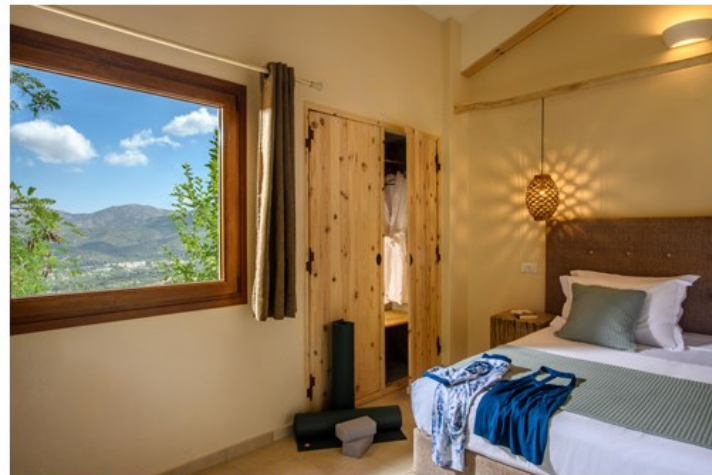
Panorama Wellness Suite (3 adults max) - upgrade

These rooms are located on the ground floor (corner room) and come equipped with either a king-size bed or twin beds as well as a spacious bathroom with a 2 person spa bath (with hydro massage) and a private garden with a veranda and a sun deck with sun beds. These rooms also come with a fireplace.