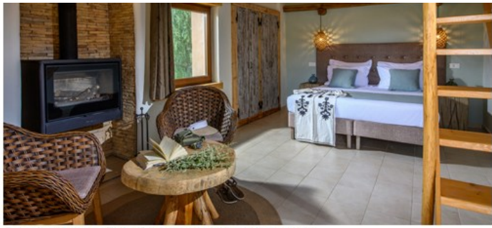
Superior Wellness Suite (3 adults + 1 child max) - upgrade This room is located on the top floor of the hotel and offers incredible views. It comes with a balcony and a private garden with furnished veranda and a sun deck. Like the wellness rooms, in addition to the bedding (King size bed or twins + twin bed on split level bedroom), this room features an infrared sauna cabin for 2 with color therapy. It also has a private bathroom with a 2 person corner spa bath (with hydro massage). These rooms also come with a fireplace.