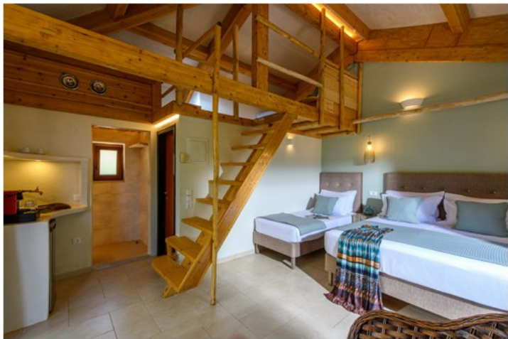
Panorama Family Room (4 adults max) - included for 3 pax This room is located on the first floor and comes with a private balcony and 1 private bathroom. Beddings arrangements include 1 room with a queen size double bed (not possible to split), and a single bed. there is also a single bed on a split level floor. The amenities include a fire place, coffee corner and walk in closet. In case a group of 2 people wants to upgrade to this room category, they will need to pay a single supplement fee.