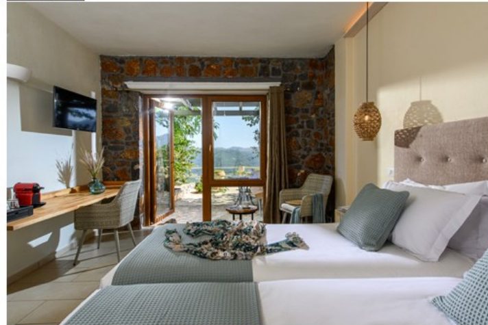
Classic Room (2 adults max) - included for 2 pax

These rooms are located on the ground floor and have access to a patio and garden. They come equipped with either a king-size bed or twin beds and a private bathroom.