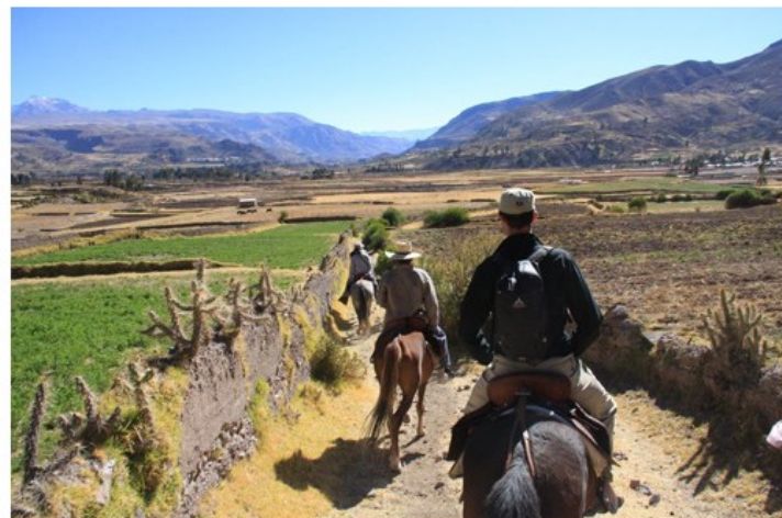
EXTENSION 1 - COLCA VALLEY