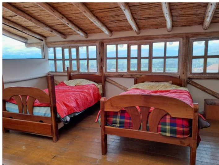
Guesthouse in Misminay

You will be accommodated in a simple but comfortable private rooms.