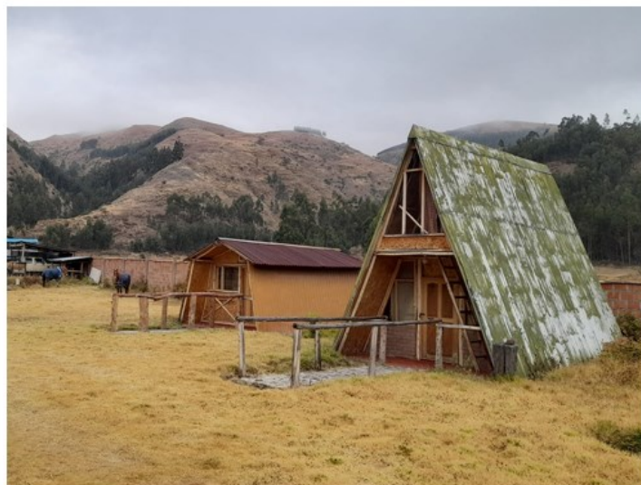
Lodge in Compone

You will be accommodated in a simple but comfortable private rooms.