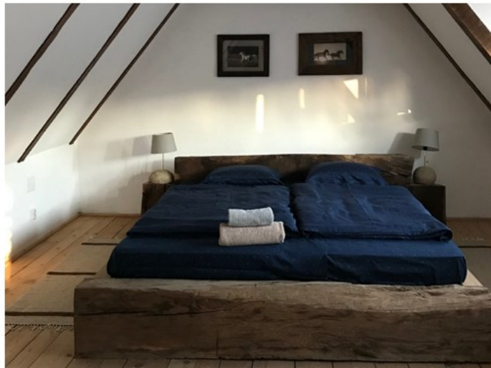
Guesthouse in Șinca Nouă

The guesthouse has 9 double rooms, each with a bathroom. Downstairs, there is a nice dining room and there is