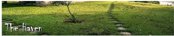
Haven River Lodge

The Haven is a peaceful and relaxed River Lodge, a perfect hideaway, located at big rapid on The River Nile. You enter at the camping area, which is fully fenced and is where the horses happily graze. The restaurant and bar sit in the middle of the compound overlooking the mighty Nile where its width exceeds 500 meters. All rooms are self-contained spacious bungalows with private showers overlooking the river. There is Wi-Fi access available from each bungalow. There is also a small outdoor swimming pool.