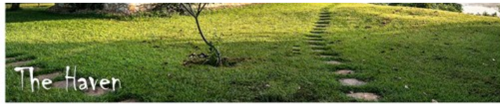
Haven River Lodge

The Haven is a peaceful and relaxed River Lodge, a perfect hideaway, located at big rapid on The River Nile. You enter at the camping area, which is fully fenced and is where the horses happily graze. The restaurant and bar sit in the middle of the compound overlooking the mighty Nile where its width exceeds 500 meters. All rooms are self-contained spacious bungalows with private showers overlooking the river. There is Wi-Fi access available from each bungalow. There is also a small outdoor swimming pool.