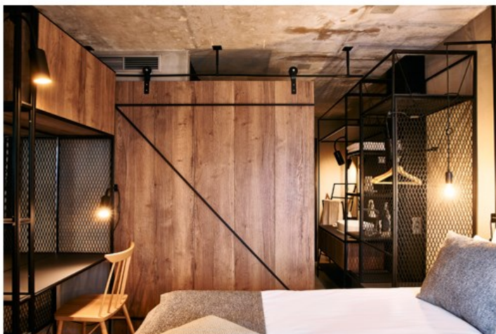
Rooms for solo travelers

There is a laundry service available to guest for an extra charge.