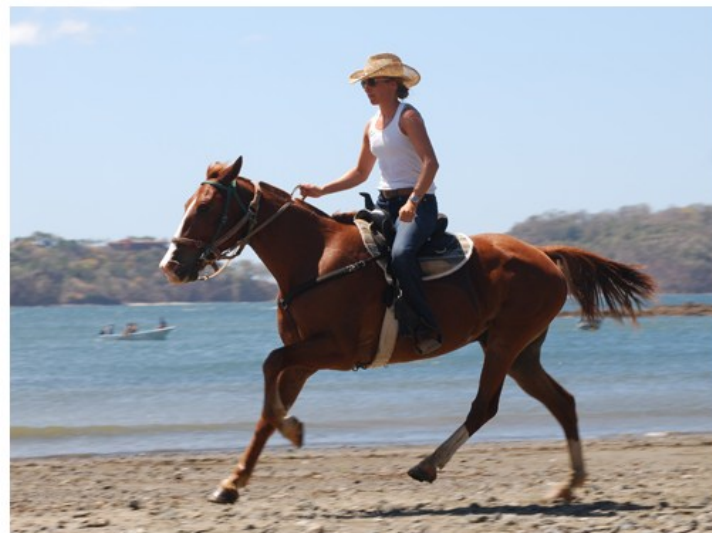
Beach Riding Extension