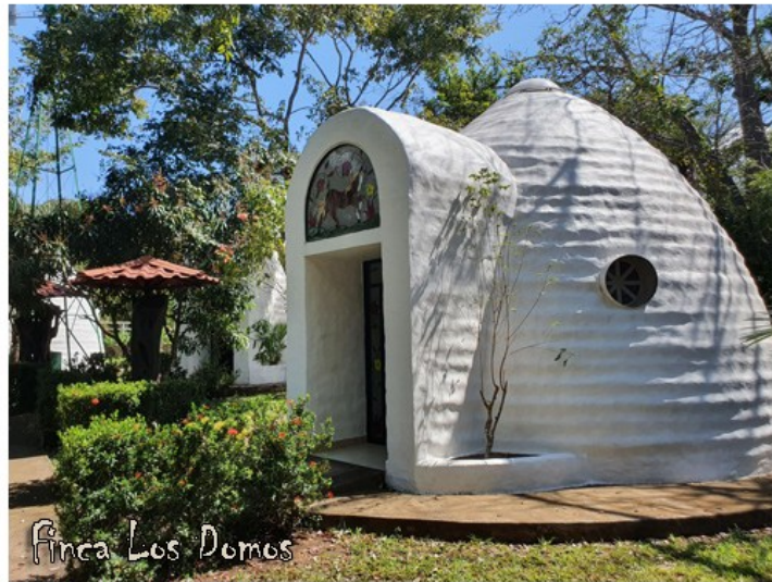
Finca Los Domos near Orotina

This hotel offers comfortable bedrooms equipped with a TV, small fridge, ensuite bathroom and free Wi-Fi access. There is also an outdoor pool where guests can relax.